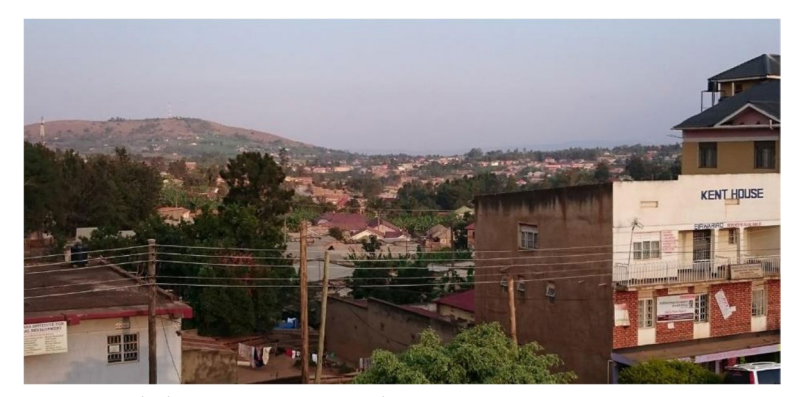
Fig. 3 View over central Mbarara, 2018.

the wealthiest were at the tops of hills, with declining socio-economic status accompanying declining topography.