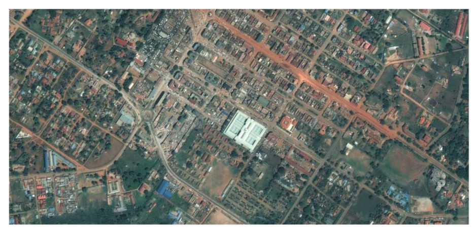
Fig. 2 Ordered block layout of Mbale centre. The large structure is the 2016 rebuilt central market hall where the majority of the households purchased their food. A few untarred roads can be seen clearly. Pleiades Satellite Image of Mbale taken on 8 March 2015